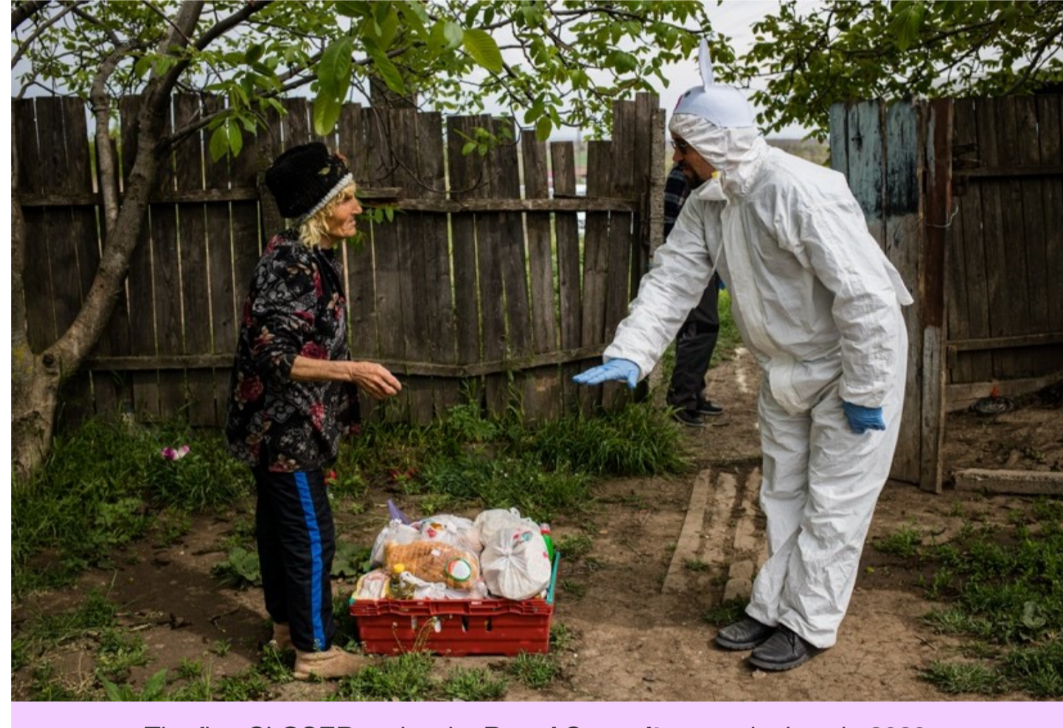
The first CLOSER project by Bunul Samaritean took place in 2020.

We'll present all of the 8 projects that received grants from the EU Staff Fund for Fair and Sustainable Future in this inaugural round. This time, we'd like to highlight two projects that aim to increase the quality and the environmental sustainability of services for local communities.