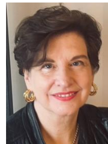
Autorin: Gudrun Schmidt

Regensburg is also worth a visit for its culinary delights, and we were able to enjoy them in various restaurants during our stay. Our annual meeting concluded with a gala dinner in the open-air brewery of the princely palace.